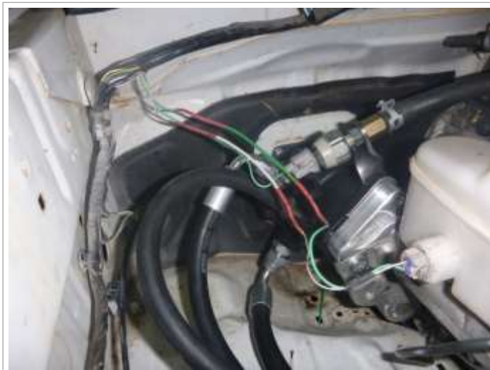
Image 5.2 Extending sensor wiring

Using heat shrink over joined wires will prevent shorts and makes for a nicer looking install (Image 5.2)