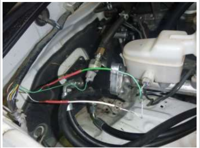
Image 5.1 Extending sensor wiring

Note: The booster vacuum sensor is no longer required and does not need to be refitted to Hydraulic Booster setup.