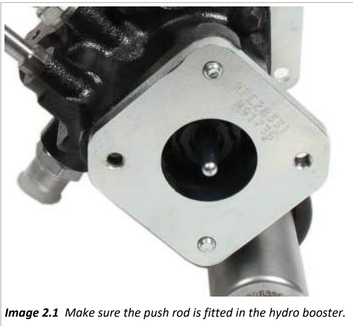
Image 2.1 Make sure the push rod is fitted in the hydro booster.

Make sure the push rod is fitted to the hydro booster – this is retained internally – as per image 2.1