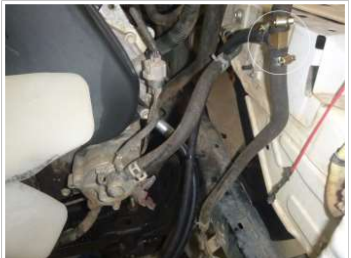
Image 4.6 Fitment to power steering resivior bottle

Run the hose to the power steering reservoir bottle. The new return line needs to be teed into the factory return line as close to the reservoir as possible to avoid restriction. Trim the hose to length & use the supplied T piece and hose clamps. (image 4.6)