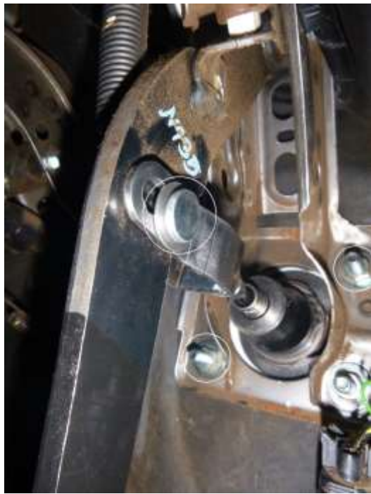
Image 3.1 Alignment of booster.

Note: A second set of hands make alignment during this process much easier