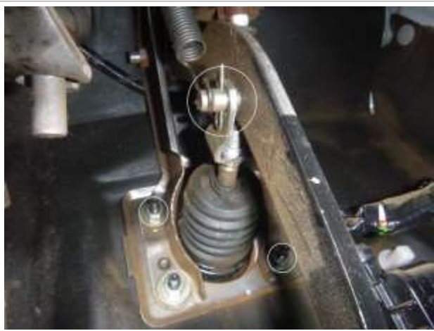
Image 1.4 Removal of the cotter pin and nuts.

Remove the cotter pin and main pin to disconnect the bracket from the brake pedal.