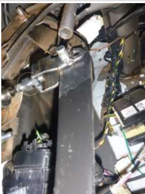
Image 3.3 Adjust the pedal saddle

Fit the factory Toyota pin with one of the supplied FW-5/16 washers on either side and install the cotter pin as per image 3.2.