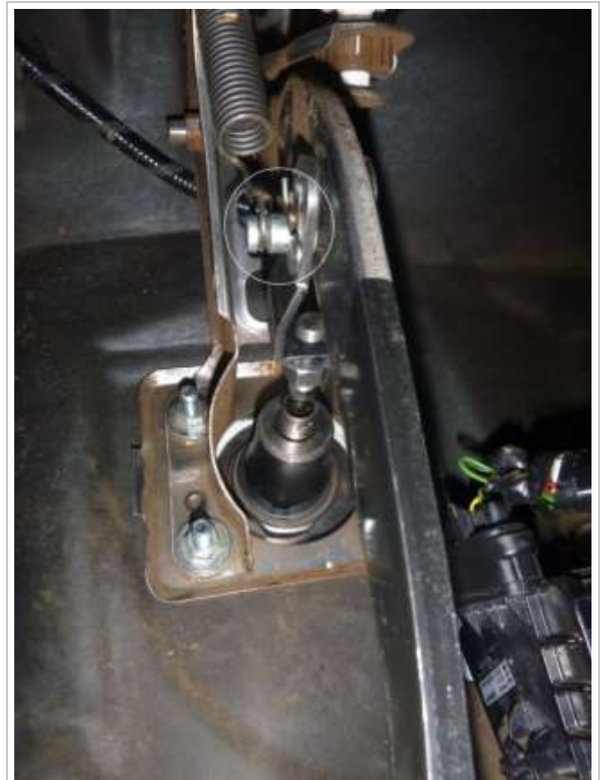
Image 3.2 Cotter pin install

Fit the factory nuts that were removed when the vacuum booster was removed. (Image 3.1)