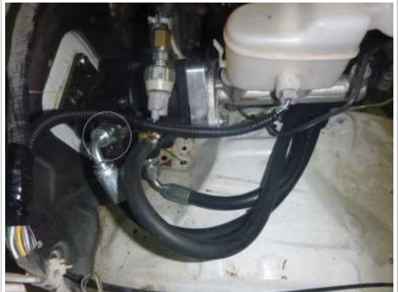
Image 4.1 Fit the master cylinder to the hydro booster