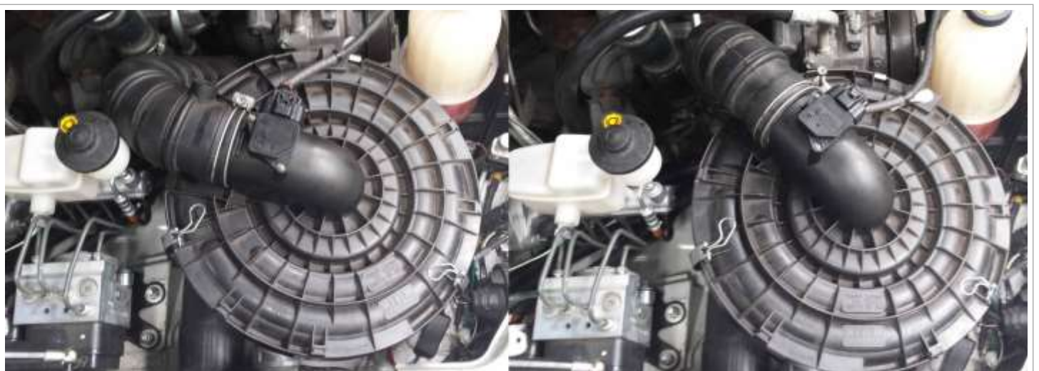
Image 6.6 Standard vs rotated

The air box to turbo hose may foul on the master cylinder, you will need to rotate the air box lid reusing the existing clips. Please see image 6.6 below