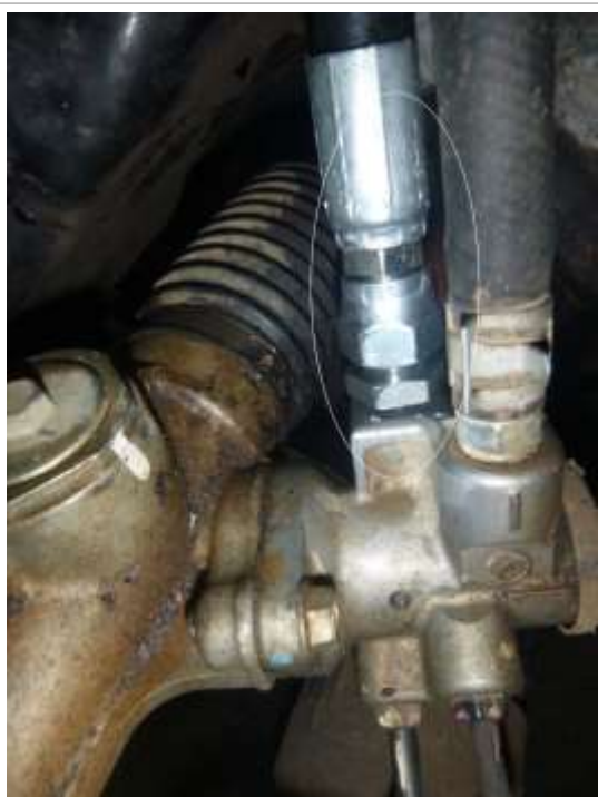
Image 4.2 Hydro boost to steering rack line