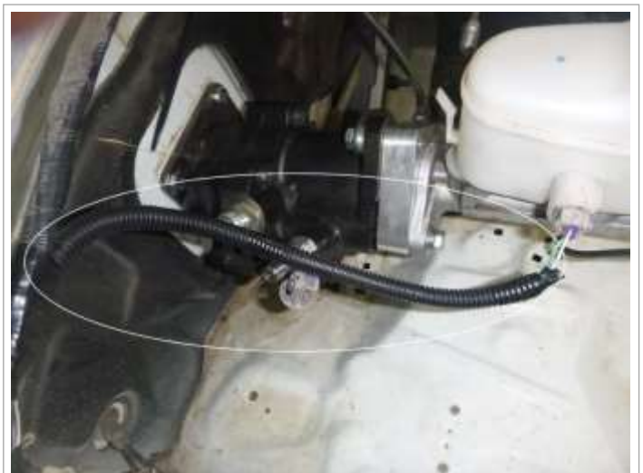
Image 5.3 Extending sensor wiring

Finish the extended wiring with a piece of corrugated tubing (image 5.3)