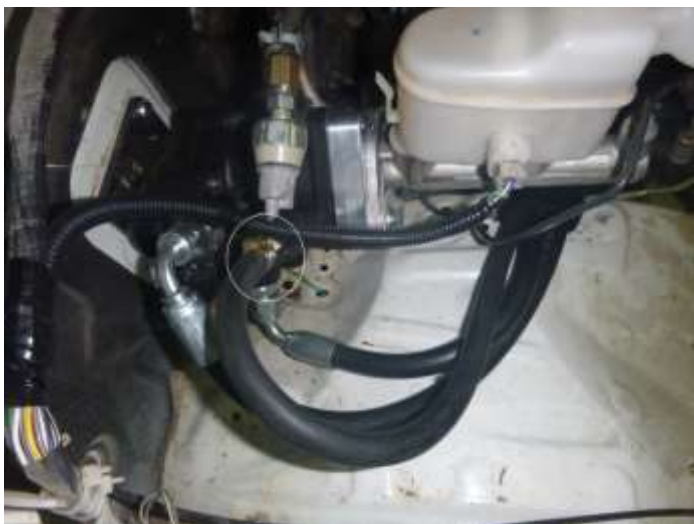
Image 4.5 Low pressure hose to barb

Fit the supplied low pressure hose to the barb on the hydro booster and secure with a hose clamp. (Image 4.5)