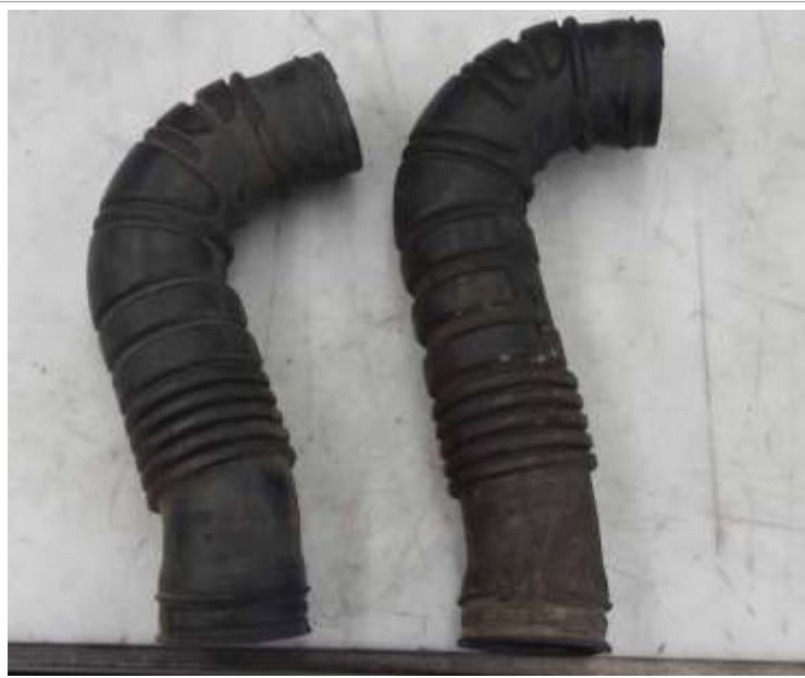
Image 6.7 Non ABS - ABS

Once the air box lid is rotated the turbo inlet hose will need to be modified, fabricated or replaced with a non ABS model hose (Toyota part number: 17881-0L110)