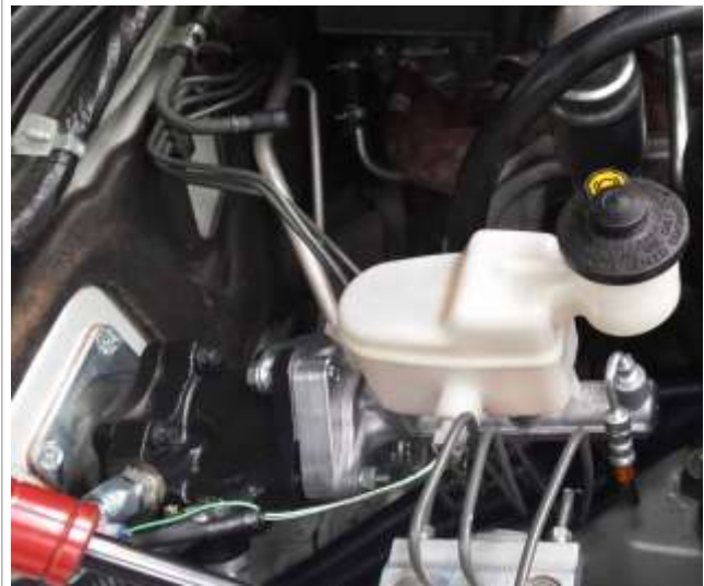
Image 1.1 Hydraulic booster setup with new master fitted

If you are not replacing the calliper lines you do not need to disconnect the brake lines from the master cylinder.