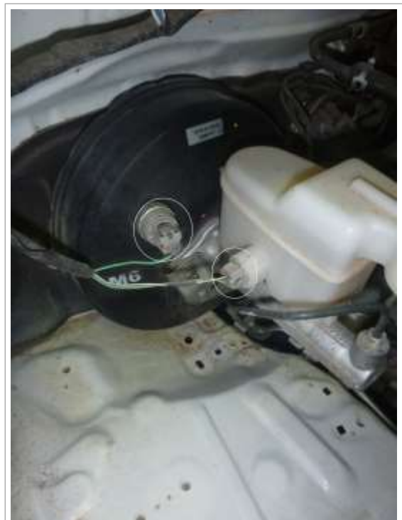
Image 1.3 Removal of sensor plugs.

See image 1.3 for the removal of the sensor plugs