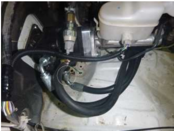
Image 4.3 Booster to power steering pump

Run the longer line up under the Hydro booster and secure loosely. (Image 4.3)