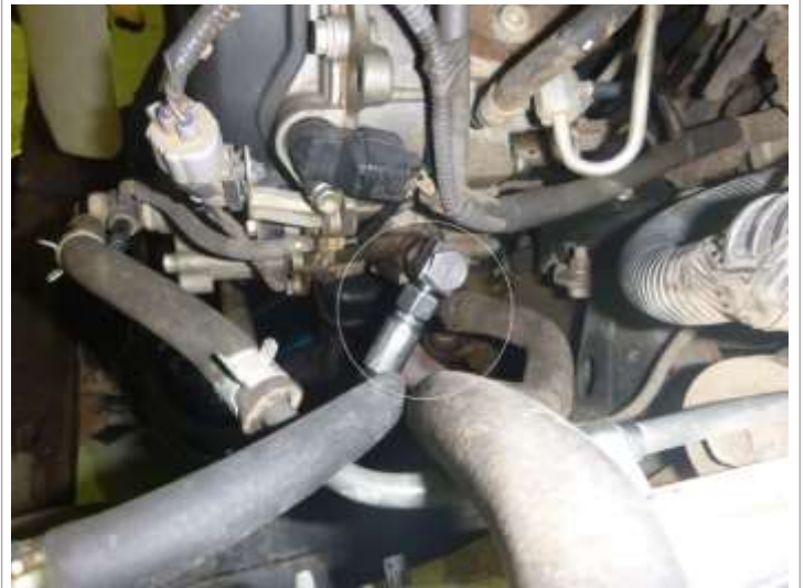
Image 4.4 Fitment to pump

Attach the supplied fitting already fitted on hose to the power steering pump. Rotate to desired angle and fasten using hydraulic sealant. Then re-fit hose to fitting and tighten using two spanners. One spanner on pump fitting and one on hose. This will insure that the fitting on the pump is not broken off while fastening hose (Image 4.4)