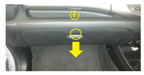
The cabin filter is located right behind the glove box. To get access to the filter it has to be removed. Follow the instructions as follows