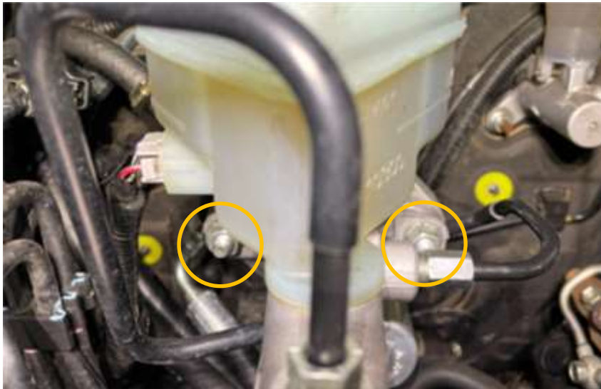
Image 1.2 Remove nuts holding master cylinder to booster

Remove the 2 nuts that are holding the master cylinder to the brake booster.