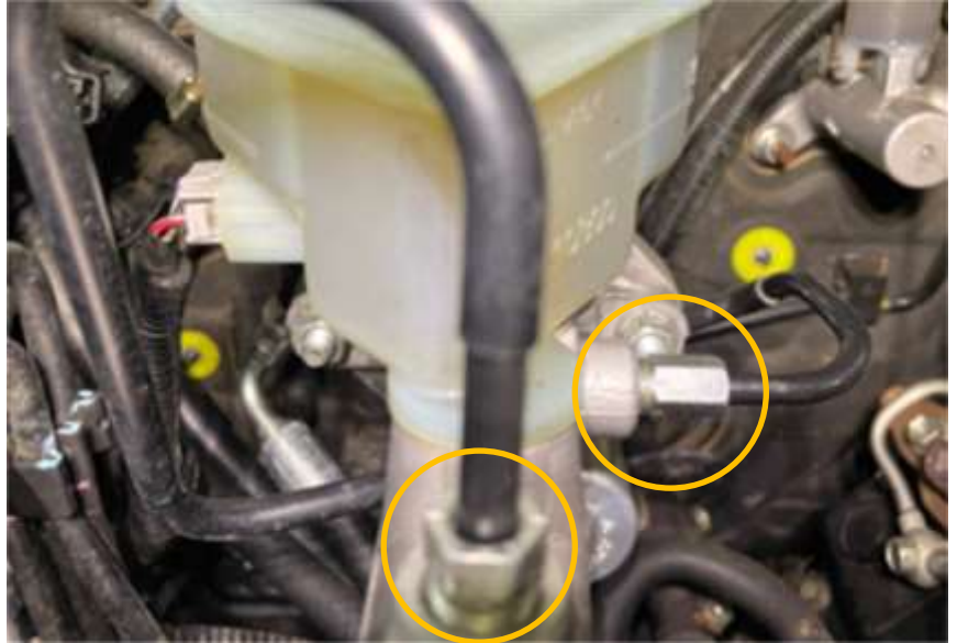
Image 1.1 Disconnect the solid brake lines