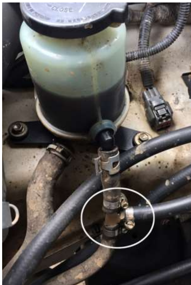
Image 4.1 Power reservoir tee

Secure the new hydraulic lines to your vehicle making sure they will not foul on things such as the steering coupling, exhaust etc. Depending on your engine bay you may be able to use P clips and or cable ties to secure the lines.