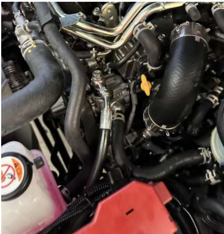
Image 3.8 Power steering pump fitted with new hose

Fit the hydraulic line using the original banjo bolt with supplied copper washers fit to the power steering pump.