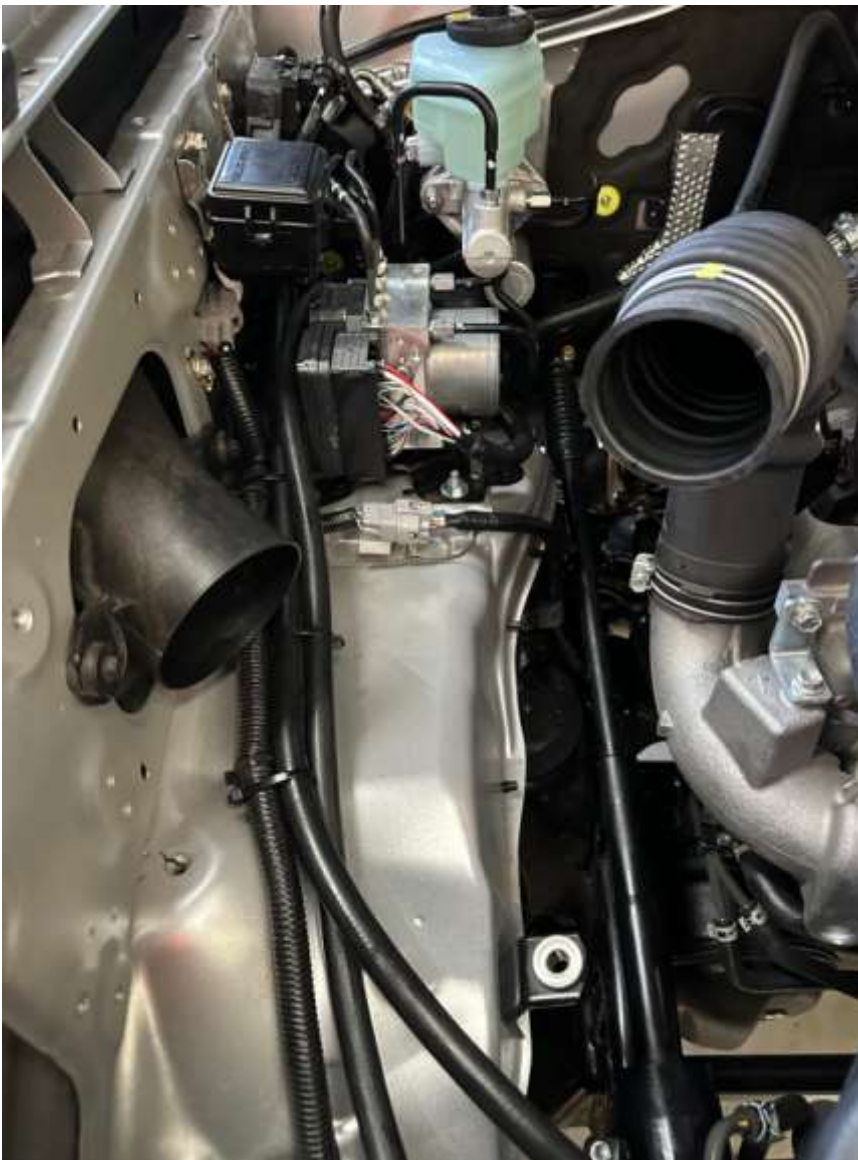
Image 3.4 Line routing behind ABS unit

Run the longer hydraulic line up behind the ABS unit to the hydraulic booster Image 3.4 The 90° fitting needs to be at the hydraulic booster.