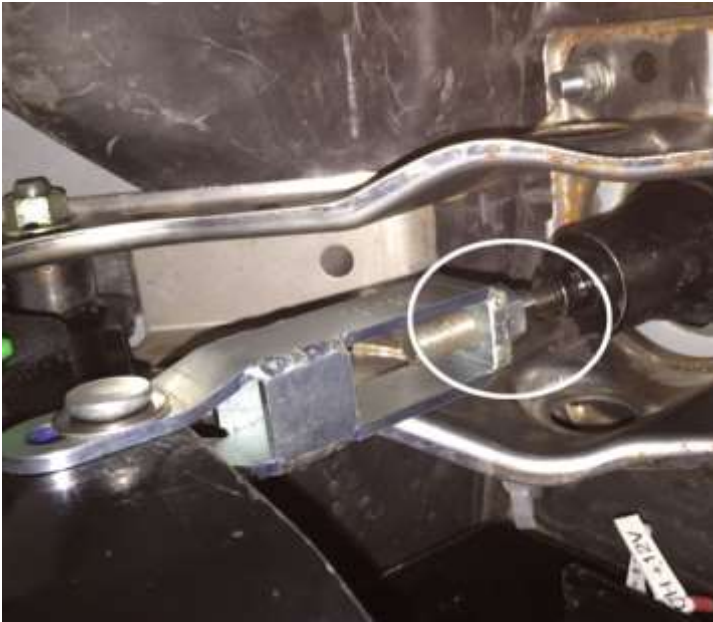
Image 2.4a Adjust the pedal saddle

You will need to adjust the pedal saddle by using an 8mm spanner across the flats (as circled in the photo Image 2.4)