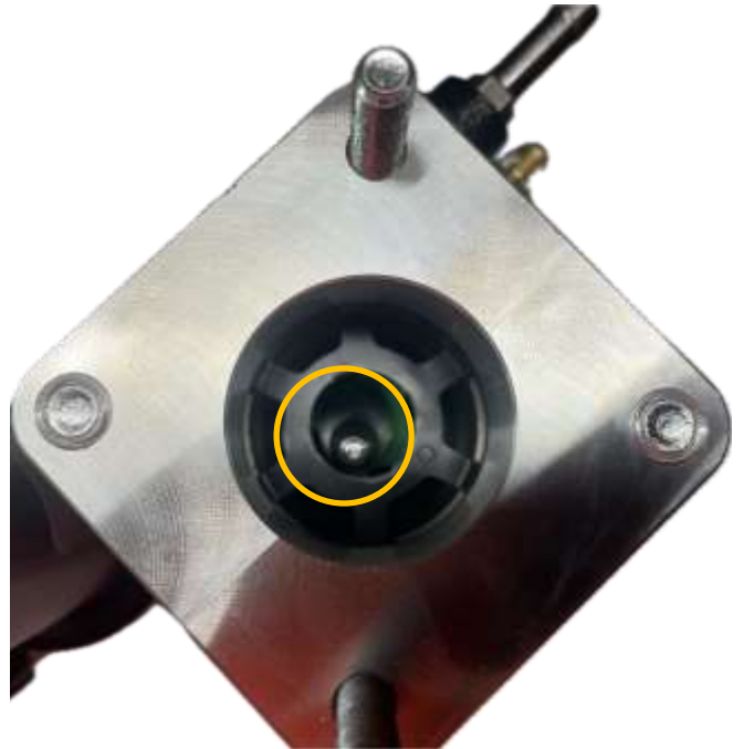
Image 2.1 Make sure the push rod is fitted in the hydro booster

Make sure the push rod is fitted to the hydro booster – this is retained internally – as per image 2.1