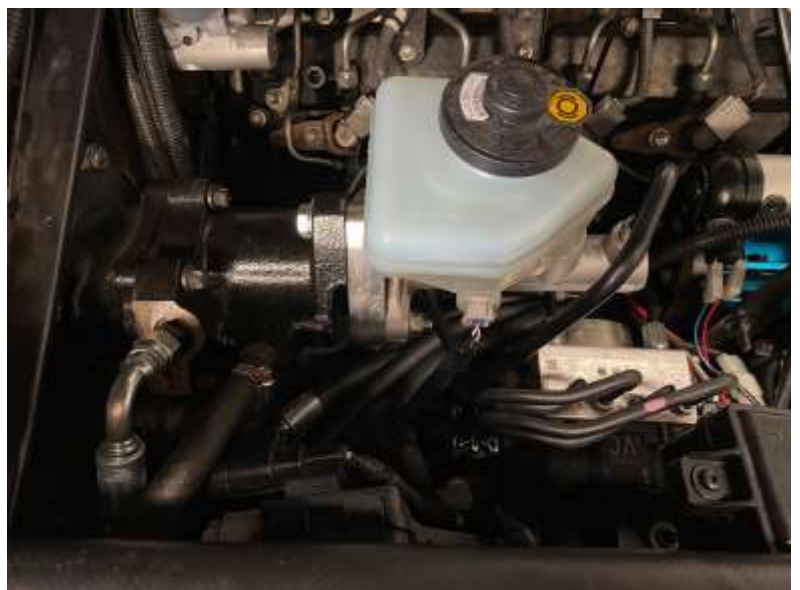
Image 2.5 Fit the master cylinder to the hydro booster

Check the brake/stop switch clearance is between 0.5 to 2.4mm & confirm brake lights are working as required.