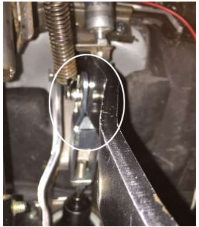
Image 2.3 Cotter pin install

Fit the factory Toyota pin with the supplied FW-5/16 washers on either side and install the cotter pin as per image 2.3