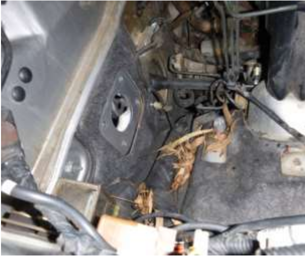
Image 1.4 Booster removed

Disconnect the vacuum pipe that runs between the booster and vacuum reservoir. The booster can now be removed from the firewall.