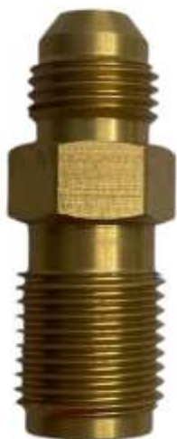
Image 3.1 Power steering box adaptor fitting

Note: Once you crack this line power steering fluid will drain out – have a bucket and rags ready.